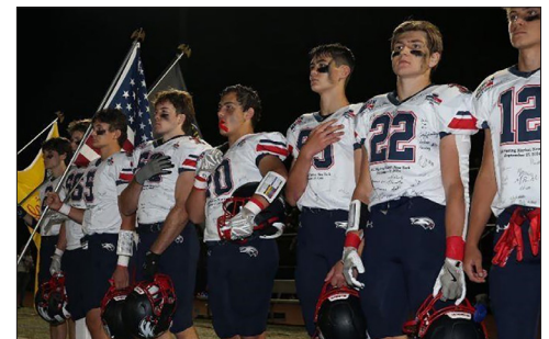
Veterans and members of the varsity football team paid their respects during the national anthem prior to kickoff.